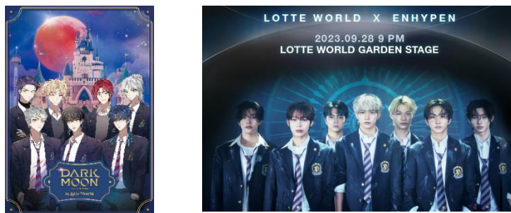
<Figure 5> Collaboration between Lotte World and "DARK MOON"(ENHYPEN)

Additionally, the "Dark Moon Castle" event, a collaboration between Lotte World and ENHYPEN's "DARK MOON" series, underscores the commercial potential of such integrations. Held from September 1 to November 19, 2023, the event resulted in a more than 17% increase in visitor numbers at Lotte World, [13] reflecting the positive impact of character-themed attractions on both engagement and revenue.