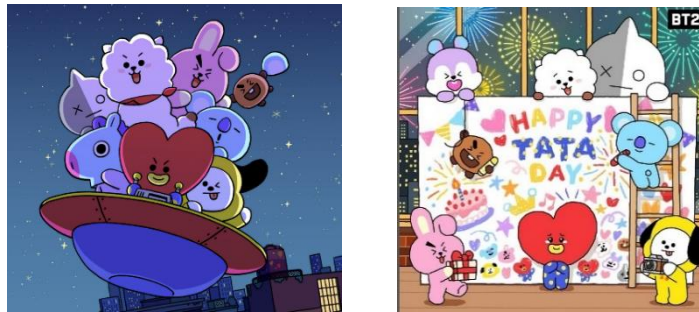
Figure 2. BT21 Concept art Image