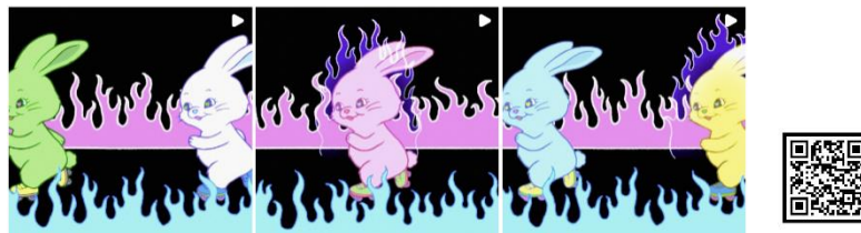
Figure 3. ADOR Corporation Instagram Image

In 2022, "NewJeans," an independent label, took a unique approach to marketing. Unlike traditional methods, there were no teasers featuring the real images of the artists. Instead, the promotion included an animation video on Instagram featuring five rabbit characters.