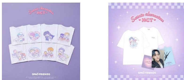
Figure 4. NCT X Sanrio Character Product Image

An example of generating revenue by integrating characters with various industries is 'NCT CCOMAZ,' from SM Entertainment's group NCT. In April 2023, the NCT characters launched a grocery store-themed pop-up store called 'NCT CCOMAZ GROUP STORE,' which sold a range of merchandise and promoted the artists. This initiative showcases the innovative use of themed retail spaces to create unique consumer experiences, directly engaging fans in physical locations and strengthening brand loyalty. Additionally, their collaboration with the popular character Sanrio highlights a strategic cross-industry partnership, using established character brands to enhance market presence and diversify product offerings.