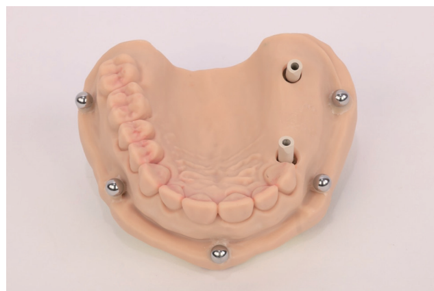
Fig. 1. Models simulated three-unit or four-unit two-implant-supported (BLT Implant, Ø 4.1- mm RC; Straumann, Basel, Switzerland) fixed partial denture situation. Distal implants were tilted mesially 20°.

Primescan (Dentsply Sirona, version 5.0.1) (PS), Trios 3 (3Shape, version 1.18.2.10) (T3), Trios 4 (3Shape, version 19.2.2) (T4), and CS3600 (Carestream dentistry, version 3.1.0) (CS) IOS were used to capture DII ten times (n = 10) for each model without the use of RO. The scanning sequences were implemented following the instructions provided by each manufacturer and the IOS manuals. The scans were made for full