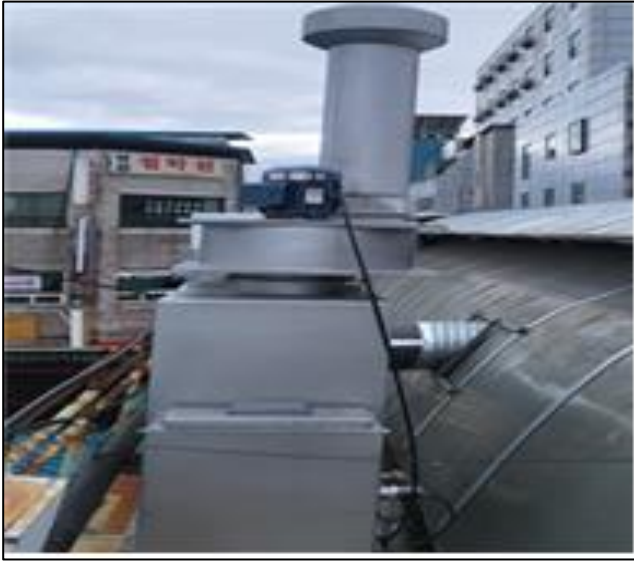
Figure 2: Sewage Odor Reduction Material Spray Device