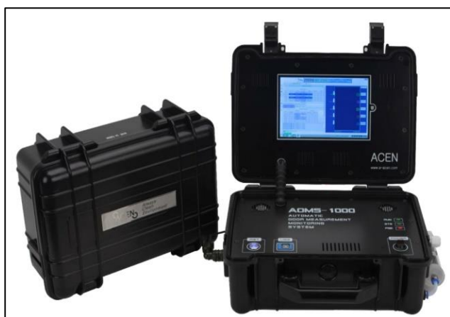
Figure 1: Odor Measurement Equipment

In this study, The Odor Measuring Equipment AOMS-1000 to measure odorous compounds, focusing primarily on volatile organic compounds (VOCs), H 2 S and NH 3 in the Wonju Jayu Traditional Market. The AOMS-1000 is a direct-reading odor measurement device that allows for continuous monitoring. Measurements were conducted for 5-minute intervals at each point, with data collected every minute. The results were averaged for accuracy. Additionally, the AOMS-1000 features a portable and automatic odor sample collection system, which can be controlled remotely via the CDMA wireless communication system. This allowed for the collection of standby samples in areas where direct user operation was challenging. Through SMS commands, the device could be activated remotely, making it highly efficient for long-term monitoring.