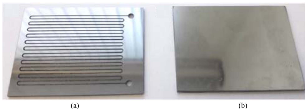
Fig. 1. Optical image of as-developed planar microfluidic chromatographic column. The process of creating the planar gas chromatography columns consists of the following steps: the first stage ( Fig. 1(a) ): channels formed on the aluminum plate by milling (0.6 × 0.6 mm - cross-section; 0.8 m length); the second stage ( Fig. 1(b) ), the resulting aluminum plate with channels is connected with another one by the chemically inert thermoplastic resin

The chromatograph has 3 independent chromatographic lines. Chromatographic separation of the sample occurs along all three lines simultaneously, which can significantly reduce the analysis time. The analyzed or calibration mixture enters the channels of the microdosers. To switch gas flows, each microdoser is equipped with two electrically controlled pneumatic distributors, which are mounted on a flat plate.