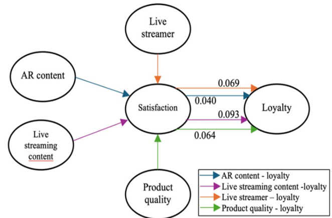
Figure 2: Result Model for Indirect Effect