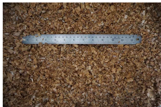
Fig. 1. Teak sawdust of a private teak plantation.

Teak sawdust from a private teak plantation was obtained from a wood factory in the Sungmen District, Phrae Province, Thailand, as shown in Fig. 1. The particleboard was processed, and its properties were tested at the Maejo University Phrae Campus, Phrae Province, Thailand. The sawdust was screened using a sieve with