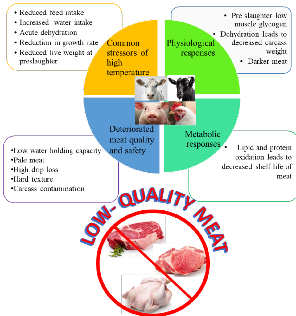
Fig. 2. Relationship between heat stress and physiological response of the meat animals.

Thyroid hormones regulate the skeletal muscles' calcium content, related to bone strength and body growth [32]. Warm-blooded farm animals alter their thyroid hormone secretion rate according to ambient temperature fluctuations. For example, when the temperature increases, the secretion of thyroid hormone rate decreases, and vice versa [33]. Chickens have been found to exhibit a negative association between their plasma T3 concentration and the surrounding temperature, as reported by Tao et al. [34]. It was evident that exposure to one day in the heat commercially bred turkeys reduced T3 levels, and there was an imbalance in T3 : T4 ratio [32].