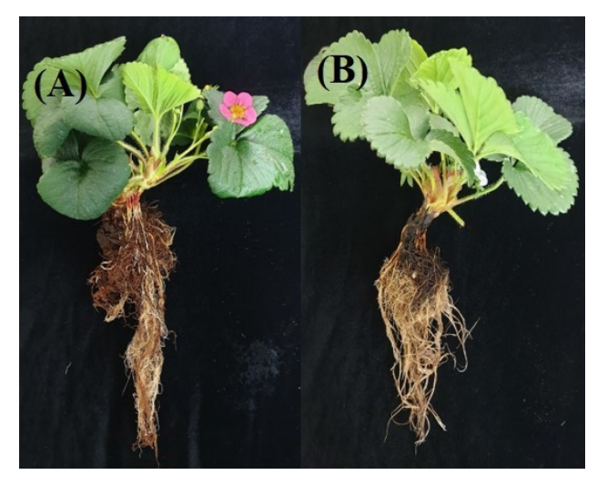
Fig. 4. Images of strawberry 'Guanha' plants grown in aquaponics (A) and hydroponics (B) for 98 days after transplanting.

<sup>z</sup>Asteriks indicate significant differences (t-test p < 0.05), each value is the mean of 30 replications.