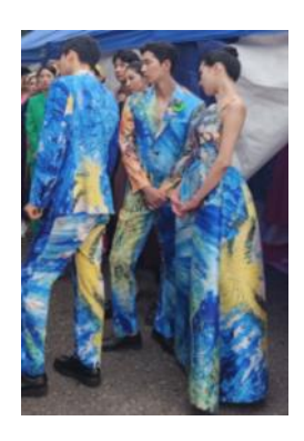
Figure 4. Paris Collection Dress and Suit

The symbolism and emotional expression of color are important factors that represent human emotions and psychological reactions and can be interpreted differently in various cultures and contexts, and a closer look at them is as follows. First of all, in terms of the symbolism of color, color has various symbolic meanings according to cultures. For example, white symbolizes marriage and purity in the West, but can be related to funerals in some Asian cultures (Stangos, 1994). Certain colors have universal meanings, for example, red gives passion and love, and blue gives calm and stability. This comes from the feeling of reminding a wide and infinite space with the colors of the sky and the sea (Prater, 2003). And thanks to such a calm and stable image, the image that comes to mind when blue also plays a role in hope and expectation.