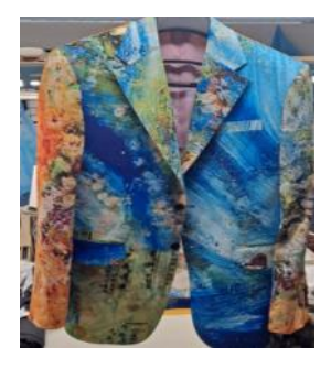
Figure 8. Complete Paris Collection Suit

Choosing a color, shape, style, etc. induces an emotional response and reflects the individual's inner world. Self-expression is also influenced by the culture and social context to which the individual belongs. In certain cultures, expressing the self in a certain way can be emphasized. Self-expression becomes an opportunity to show creativity, and individuals can express themselves through their own unique style or idea and communicate with others through this (Kawamura, 2004).