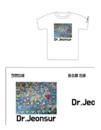
Figure 6. 'Love & Bless' T Shirts

In this way, self-expression is the purpose of the process in which an individual understands and defines oneself, and a unique identity is formed through complex action of an individual's background, values, and experiences. As can be seen from <Figure 12> and <Figure 13>, self-expression is an important means of expressing emotions, and emotions such as joy, sadness, and anger can be expressed through language, art, or action. I tried to express the feelings of love and joy in life through the following fashion (Gage, 2000).