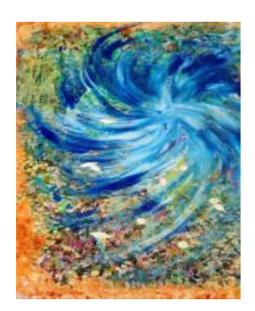
Figure 1. JEONSUR, Love & Bless, Mixedmedia on Canvas, 91×116.8cm, 2023.

creates new colors by overlapping several colors in the step of color, or a technique that creates new colors by overlapping transparent colors. This gives depth and texture, and is effective in expressing complex emotions. Free brush strokes are also important, and color abstract artists often use free brush strokes to emphasize the flow and movement of colors. It enables the immediate expression of emotions and gives vitality to the work. Researcher, I, also expresses my earnest desire and desire for hope through numerous acrylic paint and resin works. In addition, with intense brush strokes, the swirls that swirl around the screen with confidence are drawn. The ratio and arrangement of colors are also important, and artists try to achieve a balanced composition by controlling the intensity, brightness, and texture of the color. The researcher, I, also tried to express a variety of feelings by controlling white, brightness, and saturation, starting with the primary colors. Sometimes an unstructured shape or line is used to reinforce the independent expression of color, which further highlights the emotions that color conveys. Various lines and forms that are not clearly revealed even in the researcher's work are expressed in free handwriting.