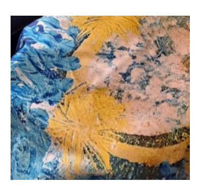
Figure 5. Paris Collection Suit Fabric