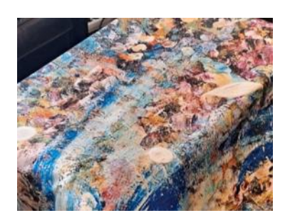
Figure 7. Paris Collection Suit and Dress Fabric

In this way, self-expression is the purpose of the process in which an individual understands and defines oneself, and a unique identity is formed through complex action of an individual's background, values, and experiences. As can be seen from <Figure 12> and <Figure 13>, self-expression is an important means of expressing emotions, and emotions such as joy, sadness, and anger can be expressed through language, art, or action. I tried to express the feelings of love and joy in life through the following fashion (Gage, 2000).