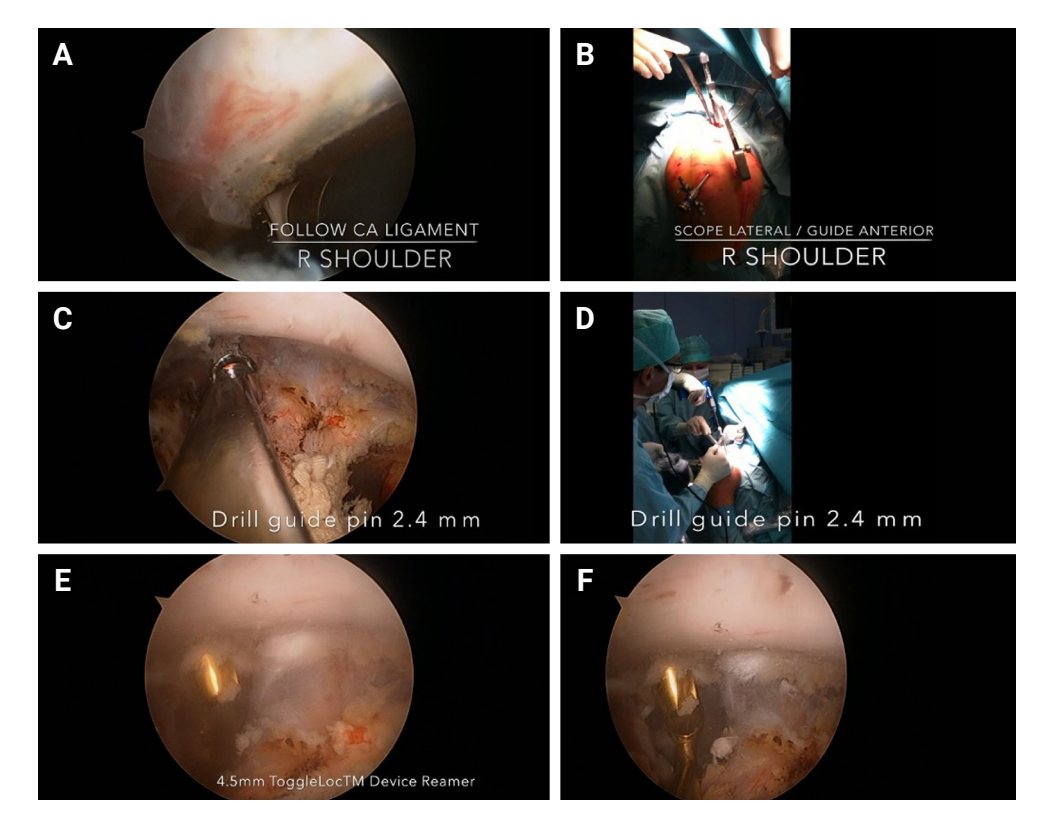
Fig. 1. Surgical Technique. (A) Subcoracoid area is cleaned with a soft tissue shaver and radiofrequency probe by following the coracoacromial ligament towards the base of the coracoid. (B) The arthroscope is switched lateral and guide is placed anterior to this position in the accessory anterolateral portal. (C, D) The 2.4-mm guide pin is drilled antegrade towards the coracoid, passing the 4 cortices. (E, F) Tunnel is drilled with the cannulated 4.5-mm drill, avoiding any accidental subcoracoid neurovascular injury by placing a protecting curette under the tip of the guide pin.

Next, the arthroscope is introduced in the subacromial space and a limited anterior bursectomy is performed through a mid-lateral portal to allow sufficient visualization of the anterior subacromial compartment. The camera is then switched to the lateral portal and an accessory anterolateral working portal is created. Through this latter portal the subcoracoid area is progressively cleaned with a soft tissue shaver and radiofrequency probe and the base of the coracoid is cleared of tissue until the medial edge of the coracoid is clearly visible and outlined (Fig. 1A). The axilla of the