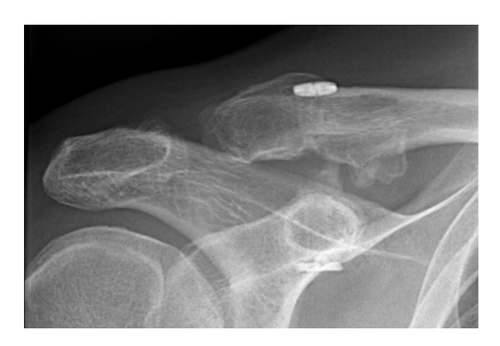
Fig. 4. Coracoclavicular ligament ossifications.

During the diagnostic glenohumeral arthroscopy we found 31.3% of patients had concomitant lesions. Five SLAP type 1 le-