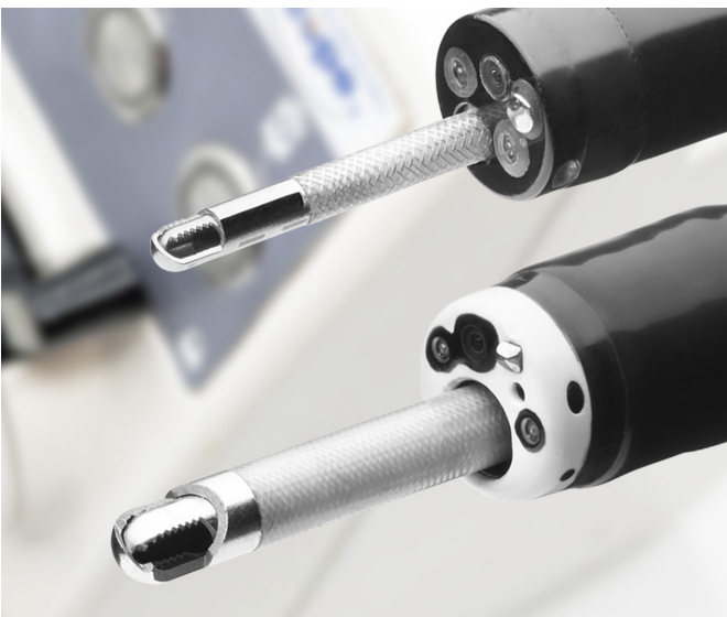
Fig. 3. Side by side comparison of the two sizes of the powered debridement device with the 3.2-mm catheter on top and 6.0-mm catheter below.

small amount of necrotic tissue and a large amount of pink viable tissue were observed within the cavity (Fig. 1D).