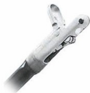
Fig. 1. The Olympus FB-45Q-1 forceps used in this study require a 2.2-mm working channel.

This pilot study found that side-opening biopsy forceps were