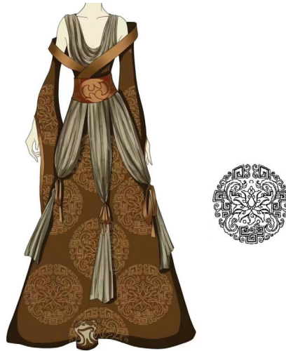
Fig. 3. The apparel design proposed in this paper.

After comparing and verifying the accuracy of the three intelligent algorithms in evaluating apparel designs, they were used to evaluate the design proposed in this article. The design proposed in this article is shown in Fig. 3, which is an ancient-style dress with a main color of earthy brown, with patterns generated using the fractal algorithm on the surface of the dress and cuffs. Table 2 shows the scores obtained from the human evaluation of the design using the AHP method, as well as the scores given by the three intelligent algorithms. Based on the weights given by the AHP method, the total manual score for the design was 7.86, the total score given by the SVM model was 7.76, the total score given by the BP model was 7.75, and the total score given by the CNN model was 7.86. From the perspective of the total score, the total score of the CNN algorithm was consistent with the total manual score, while the total scores of the other two intelligent algorithms were different from the total manual score. From the perspective of different layers, the scores for every target layer indicator given by the CNN intelligent algorithm were generally consistent with the human scores, while the scores given by the SVM and BP algorithms were quite different from the human scores.