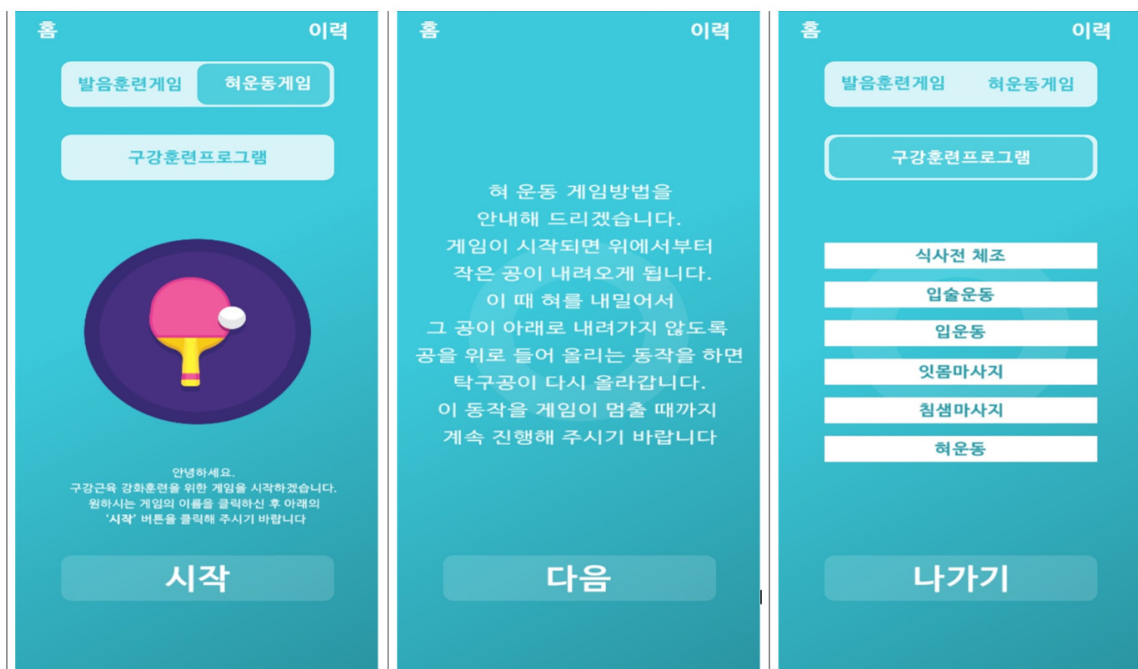
Fig. 2. Main screen of the smartphone app for oral muscle strength training