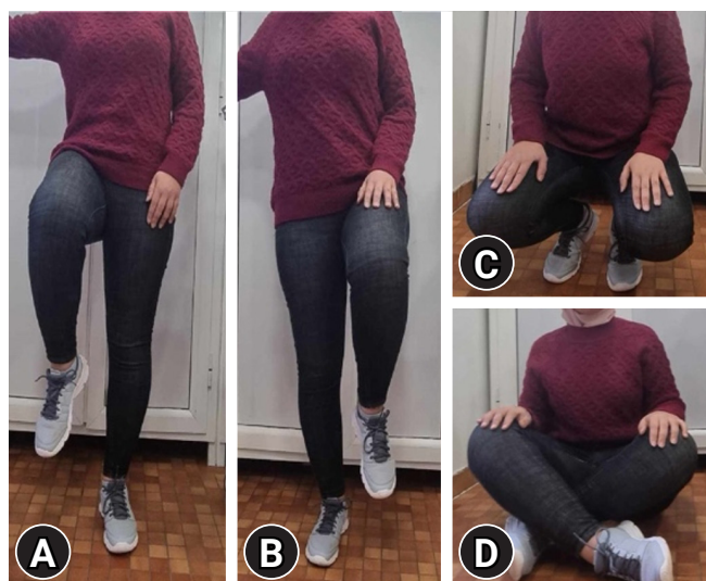
Fig. 5. Excellent functional outcomes observed 15 months after surgery. (A) Monopodal support position. (B) Hip flexion position. (C) Squatting position. (D) Cross-legged position.

outcomes regarding the Merle d'Aubigné-Postel hip score and the Harris hip score (Fig. 5), and the radiological results—represented by the Epstein-Thompson score—were excellent. Nevertheless, the patient was informed about potential progressive complications that could affect her hip, including a risk of AVN, which can manifest up to 5 years posttrauma and could potentially necessitate total hip replacement.