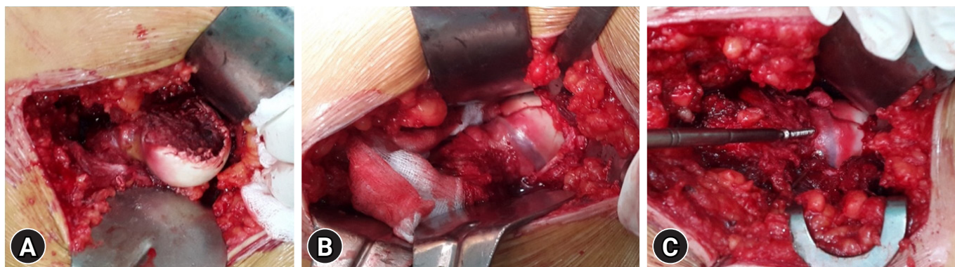
Fig. 3. Intraoperative photographs of (A) fractured femoral head, (B) reduction, and (C) fixation.