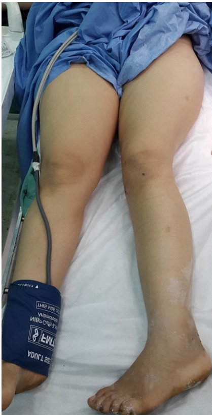
Fig. 1. Clinical photograph of the patient showing malposition of the left lower limb, with the hip in flexion, internal rotation, and adduction.

A 44-year-old woman was involved in a road traffic accident, resulting in an isolated and closed trauma to her left hip. Clinical examination revealed a malposition of the left lower limb, characterized by hip flexion, adduction, and internal rotation, with palpation of the femoral head in the gluteal region (Fig. 1). No signs of sciatic nerve injury were evident, and distal pulses were present. Radiological assessment revealed a posterior iliac dislocation of the hip, associated with a fracture of the femoral head. This fracture detached a fragment, constituting approximately one-third of the sphere and encompassing the fovea of the round ligament. The injury was classified as a Pipkin type II fracture (Fig. 2). Due to the size of the detached fragment and the risk of incarceration preventing reduction, we avoided external orthopedic reduction maneuvers. Such a procedure could have exposed this young patient to the risk of iatrogenic fracture of the femoral neck, complicating treatment and increasing the risk of avascular necrosis (AVN) of the femoral head. Instead, we opted for the Watson-Jones anterolateral approach, positioning the patient in