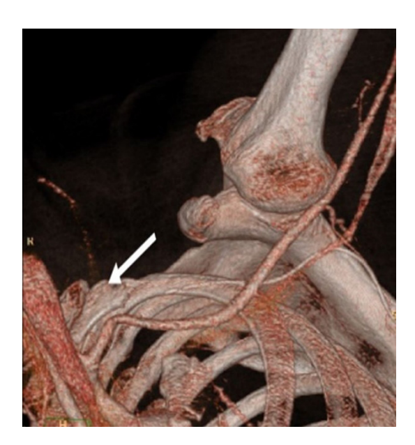
Fig. 3. Computed tomography angiography demonstrating the resolution of stenosis in the left proximal subclavian artery and the resection of the first rib (arrow).