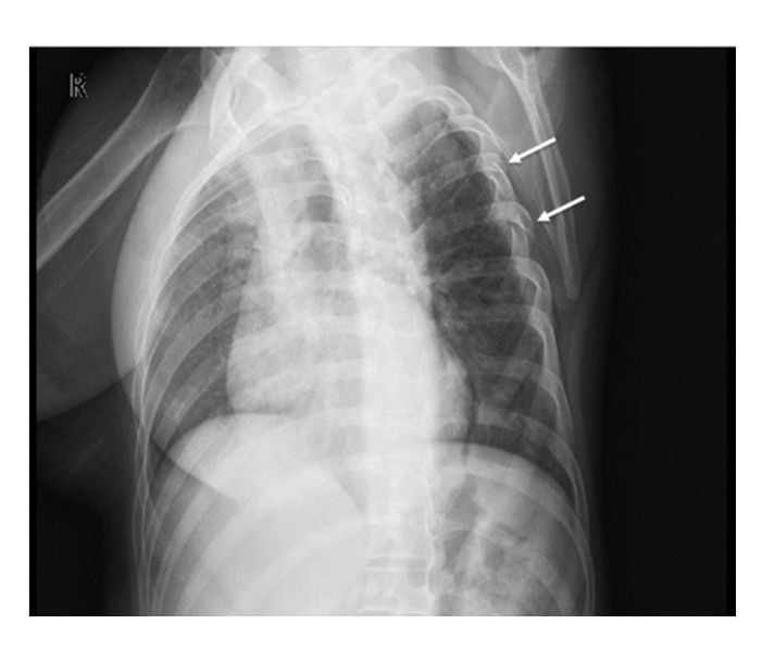
Fig. 1. Chest x-ray depicting multiple rib fractures of the left fourth and fifth ribs (arrows).

Written informed consent for publication of the research details