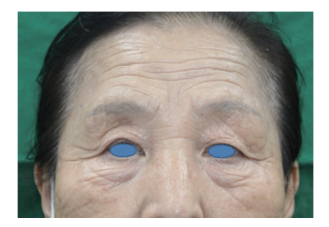
Fig. 4. A photograph showing the patient able to open both eyes evenly, without recurrence or any symptoms, 1 year after the surgery.