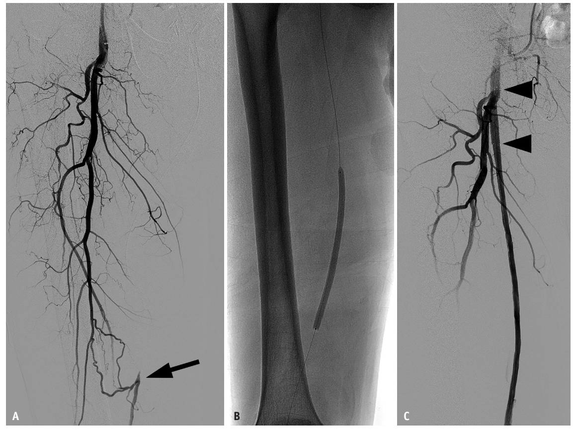
Fig. 1. A 76-year-old man with claudication. A: Common femoral angiogram showing a long-segmental occlusion of the right superficial femoral artery and reconstitution of the flow in the distal part (arrow) through collaterals from the deep femoral artery. After successful guidewire passage and pre-dilatation, Passeo-18 Lux drug-coated balloon catheters were applied. B: Fluoroscopy image showing a drug-coated balloon of 5 mm in diameter and 12 cm in length inflated in the lesion. C: Final angiography showing good arterial flow without residual stenosis after provisional stenting (arrowheads) due to elastic recoil.

target lesion, a DCB was applied to cover the target lesion and the 10 mm proximal and distal margins (Fig. 1). The DCB inflation time was 180 seconds. When multiple DCBs were required to cover a long target lesion, they were applied to maintain a minimum overlap length of 10 mm, and to minimize geographically missed areas. Pre and postdilatation using a plain balloon catheter and adjunctive endovascular devices, including bare-metal stents and atherectomy, were not limited to this study, and were applied according to the standard clinical practice of the operator.