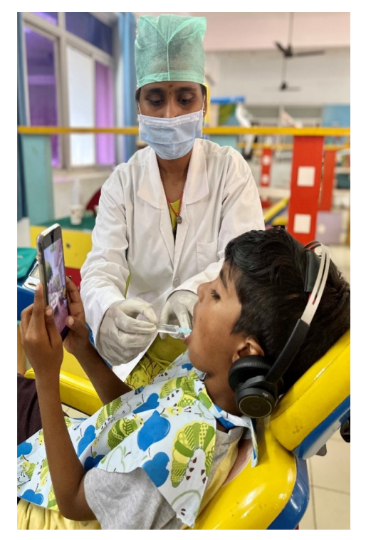
Fig. 3. Distraction using video games