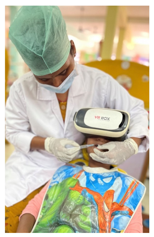
Fig. 2. Distraction using virtual reality box

Following the selection of eligible children, random allocation into three groups (Group I: kaleidoscope, Group II: VR box, and Group III: video games) was conducted using a computer-generated list. The computer generated a new random sequence for each child allocated to the trial arm. For example, sequences a, b, and c were