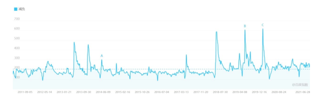
[Figure 2] Search Index of 'Burden Reduction'

According to the change of the search index of the keyword 'burden reduction' in the past 10 years (Figure 2), the peak of people's search volume for burden reduction appeared in March to September 2013, March to May 2014, March to July 2018, March to July 2019, and October to December 2019. It shows that people pay strong attention to the problem of reducing the burden during these periods. In these peak periods of search volume, or the national two sessions were held, or the introduction of relevant policies to reduce the burden, which shows that the holding of major meetings or the introduction of new policies can trigger public attention and discussion on the issue of reducing the burden. In addition, since 2018, the search index has basically remained above the average, indicating that people have continued to pay attention to this issue in recent years. This public atmosphere of continuous attention not only promotes decision–makers to further deepen their understanding of the problem of reducing the burden, reflect on the effect of the implementation of current policies, but also promotes the introduction of new policies.