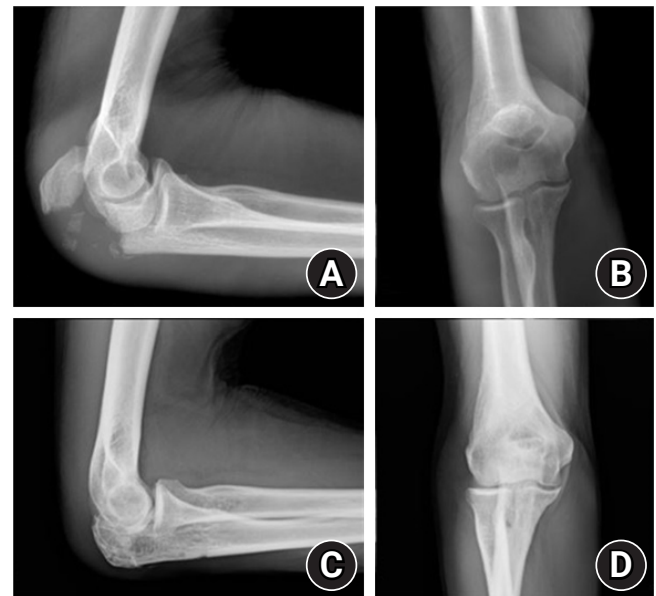
Fig. 2. Preoperative (A) lateral, (B) anteroposterior, and (C, D) postoperative radiographs of a displaced olecranon fracture treated with suture anchor fixation.

Adequate reduction and fixation were achieved for all patients in the operating room. There were no intraoperative complications noted by the senior surgeon (JAA). One patient developed a postoperative infection that required two reoperations. No hardware failure or fixation failure occurred in this series. At final follow-up, 16 of 17 patients (94.1%) achieved osseous union in an acceptable position (Fig. 2) and one patient had partial union. Despite partial osseous union, this patient had excellent functional outcomes (QuickDASH, 4.8; OES, 46) without addi-