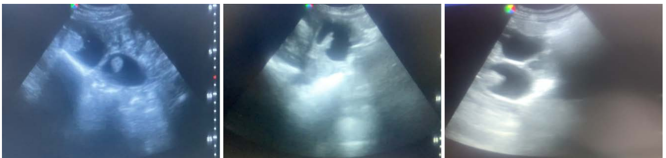
Fig. 3. Three representative images of fetal sacs on the 28th day after ET of the miniature pig. When the average of the longest diameters was obtained from a total of 10 fetal sacs, it was measured to be 4.7 \pm 0.5 cm. ET, embryo transfer.

So far, the fetal sac diameter of transgenic fertilized embryos around day 28 in minipigs has not been reported. In this study, 28-day fetal sac diameters were measured using a retrospective method from a total of 6 minipigs that had completed delivery using transgenic fertilized embryos, and a result of 4.7 \pm 0.5 cm was obtained (Total number of fetal sacs checked n = 10 ) (Fig. 3 and Table 4).