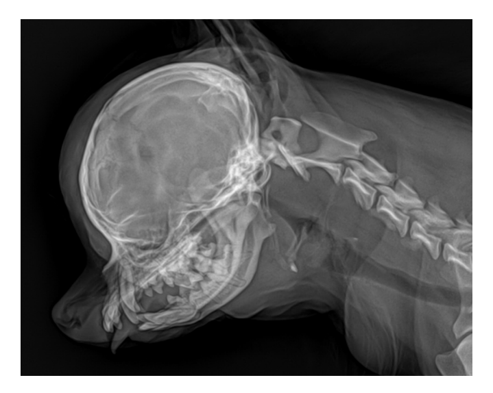
Fig. 2. On day 4, the swelling of the skull was progressively improved.

and boggy swelling of scalp [9]. Subgaleal hematoma and caput succedaneum can be mistaken for each other, as both can also extend across the suture lines, but swelling of caput succedaneum resolves more rapidly (within the first 12–18 hours) [2]. Subgaleal hematomas typically resolve within a few days to weeks, and in cases of massive bleeding or associated complications, surgical drainage may be necessary [3]. If it occurs, unlike other extracranial hematomas, infants may lose up to 50% of their blood volume into the subgaleal space [6]. Thus, it is important to differentiate these types of extracranial hematomas by performing CT and magnetic resonance imaging (MRI). If a subgaleal hematoma is diagnosed, careful monitoring for hypovolemia and additional laboratory examinations, such as for thrombocytopenia and coagulation studies, are necessary. Additional information such as intracranial hypertension, intracranial hemorrhage, and skull fracture can be obtained by performing CT and MRI.