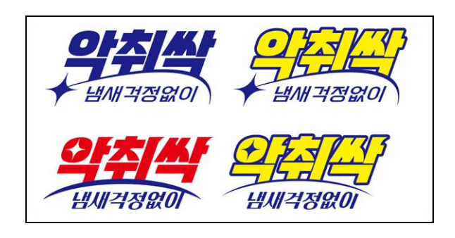
Figure 3. Odor sprout brand naming