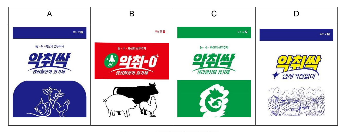
Figure 4. Packaging design

Brand package design refers to a design that can inform consumers of products, increase purchase motivation, and safely protect and transport products. Package design has the purpose of a function to protect the contents, but the purpose of packaging to increase the value of products is also becoming important. As shown in Figure 4 is because the package is the first impression of a product. Four designs were developed that included brand naming of odor buds, which means reducing and eliminating odors. It was differentiated by applying different colors and graphic images to reflect the opinions of farmers who will actually purchase it.