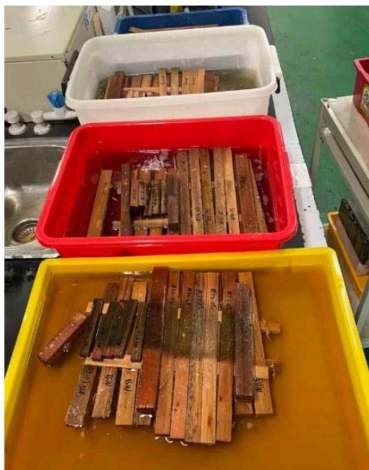
Fig. 2. Wood samples immersed in different concentrations of BA. BA: boric acid.

Where, G is the difference between the weight of test samples before and after impregnation, g; C is the solution concentration, %; V is the volume of the test samples, cm 3 .