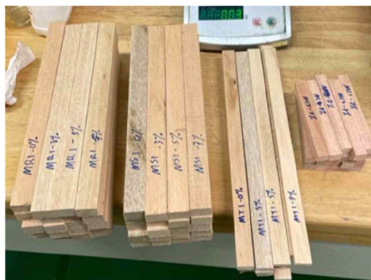
Fig. 1. Different wood samples used.

The applied test standards, number of samples and dimensions for determining the physical properties of the wooden samples were given in Table 1. The applied test standards, number of samples and dimensions for determining the mechanical properties of the wooden samples were given in Table 2.