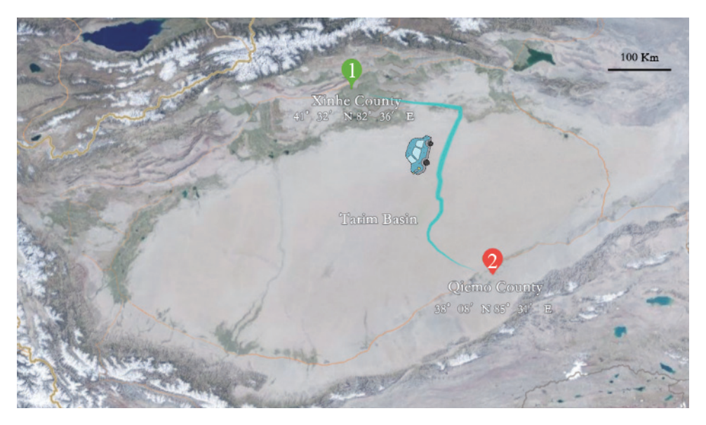
Figure 1. The green marker 1 is the starting point, the red marker 2 is the endpoint, and the total length is 783 km.

Experiment 3: To compare the effects of temperature differences, altitude differences, road conditions, and human factors on sperm quality experienced over long distances. At Dingxin Breeding Technology Co. (Xinhe County, China), we used Tris diluent to keep the semen from Simmental bulls diluted on a heated bench at 35°C. The diluted semen was cooled and equilibrated in a refrigerator at 4°C and then placed in a bubble box containing an ice-water mixture. During transport, the semen was kept in a car refrigerator at 0°C along with the foam box. The temperature was 24°C when we left Xinhe County (altitude 1,015 m, 41°32' N 82°36′ E) in the morning, and the maximum temperature was 39°C when we passed through the Taklamakan Desert at noon. In the evening, it arrived at Qiemo County (altitude 1,295 m, 38°08′ N 85°31′ E) with a temperature of 29°C (Figure 1). To compare sperm viability, and progressive motility at the same time point, after long-distance transport versus static preservation, before performing subsequent experiments. After sperm quality testing, Simmental heifers were inseminated using semen configured with Tris dilutions that had been transported over long distances and Tianshan