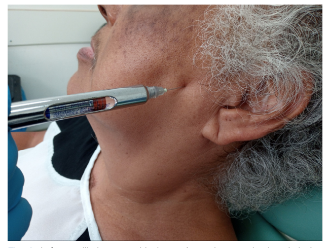
Fig. 2. Left mandibular nerve blockage. A regular carpule dental device and lidocaine 2% with epinephrine 1:100,000 were used.

visual analog scale (VAS), presented at the hospital seeking relief. The patient had a medical history of previous neurological surgeries for branches of the TN, such as percutaneous rhizotomy with radiofrequency, which did not successfully reduce the pain. The patient was taking multiple medications and reported a stroke episode that occurred decades ago, which could have contributed to the deterioration of her pain. Depression and impairment in daily life have also been highlighted.