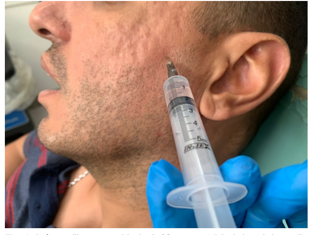
Fig. 3. Left maxillary nerve block. A 22-gauge, 1.5-inch Luer-Lok needle in a 5 ml hypodermic syringe and lidocaine 2% with epinephrine 1:100,000 were used.

emergency hospital with intense left facial pain in the maxillary dermatome (V2), described as a shock-like sensation that occurred in short episodes. The patient expressed fear of these pain episodes, which had started a few weeks prior and were triggered by seemingly trivial tasks such as shaving, touching the affected area, or yawning. Pain had a significant impact on the patient's quality of life, affecting daily routines, sleep, and professional life to the extent that he reported experiencing suicidal thoughts.