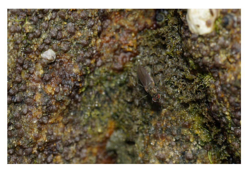
Fig. 1. Habitat of Acymatopus minor Takagi, 1965.