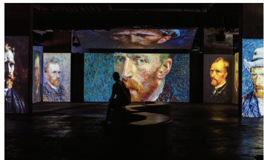
<Figure 1> Digital exhibition

Digital exhibition is an exhibition that "assembles, interlinks and disseminates digital multimedia objects" to maximize user interaction. 2) Instead of presenting brick-and-mortar artworks, digital exhibition relocates traditional artworks into a digital screen. For instance, in digital exhibitions, a person in a painting may disappear from the frame, dance to the music, or even interact with visitors, offering them a sense of immersion. <Figure 1> demonstrates an example of a digital exhibition. 3)