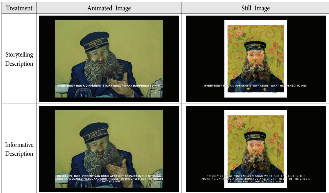
<Table 1> Different Combinations of Artworks

van Gogh (Mackiewicz and Melendez, 2016). The trailer of Loving Vincent is selected as the treatment of animated image because the movement of characters in the film is identical to that of objects in digital exhibitions. The trailer is played for approximately one-minute and presents six paintings of Vincent van Gogh in animated format. As for the treatment of the still images, the same six paintings are presented but in a traditional, still format. These paintings include Landscape with Chariot (1890), Portrait of Adeline Ravoux (1890), Portrait of Postman Roulin (1888), Bedroom in Arles (1888), Café Terrace at Night (1888), and Self Portrait (1889).