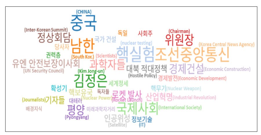
Figure 3. Analysis of Related Words

In addition, keywords that are highly related to the analysis news among the search results related to 'North Korea Science and Technology' of the four newspapers were visualized as shown in Figure 3 according to the weighting. Accordingly, keywords with high weights were China (7.83), nuclear tests (7.5), South Korea (7.28), North Korea Central News Agency (7.22), and Kim Jong-un (6.48). This can be interpreted as the emphasis on negative views such as viewing North Korean science and technology in connection with China and nuclear tests in terms of weight. Here, it can be understood that the high proportion of the Korean Central News Agency reflects interest and interest in the North Korean media. On the other hand, the number of articles on related word analysis was higher in the order of Kim Jong-Un (175), China (160), Chairman (139), Pyongyang (113), and nuclear tests (72), and dealing with North Korean science and technology, focusing on Kim Jong-un, the supreme leader.