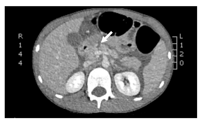
Fig. 2. Postcontrast computed tomography imaging with arrow pointing to the site of pancreatic transection.

Upon reviewing the USS report, an urgent computed tomography (CT) scan of the patient's abdomen and pelvis was requested for a more detailed evaluation. The CT scan revealed a pancreatic transection accompanied by a moderate volume of retroperitoneal and intra-abdominal free fluid (Fig. 2). Additional findings included thickening in the gastric pylorus region, likely due to the adjacent pancreatic injury, and a normal appendix (Fig. 3). Consequently, the child's abdominal discomfort was indeed caused by pancreatic injury resulting from the previously mentioned blunt abdominal trauma sustained during the quadbike