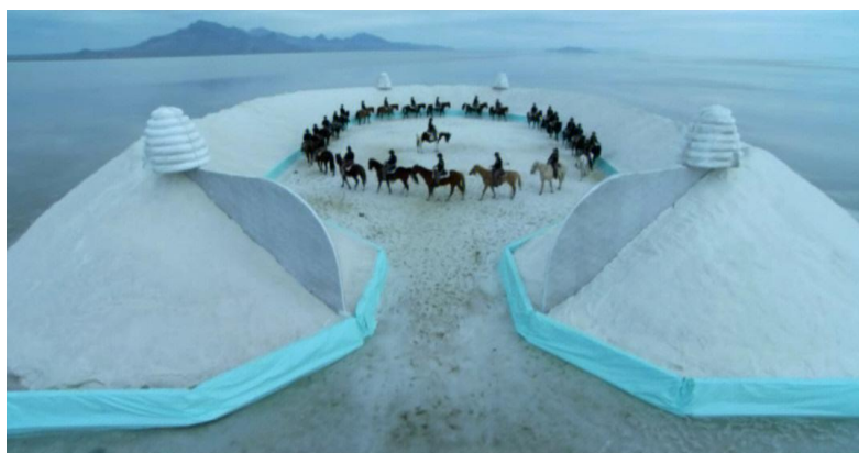
Figure 2. Cremaster 2 by Matthew Barney 1999 Image screenshot