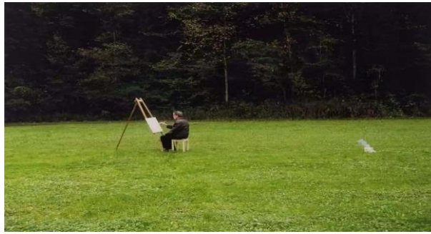
Figure 3. " Punkt " R o m a n S i g n e r S c r e e n s h o t o f 2 0 0 6 v i d e o

under the concept of " New Dimension " art should be carried out based on personal characteristics, interests, and advantages, rather than ignoring some personal characteristics and pursuing universal artistic commonality. The process of transforming the uniqueness of self into works is more like a process of self-image shaping or self-packaging. Our personal advantageous attributes should be enlarged as much as possible, and reflected in the creation through "artistic processing" through thinking. Our Artistic creation will naturally present a distinctive personal idiosyncrasy.