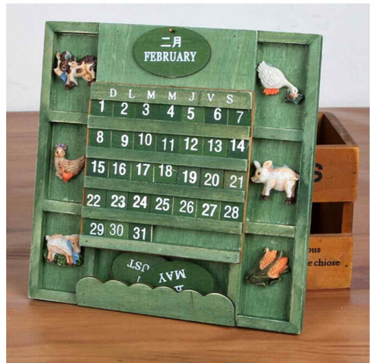
Fig. 2. Waste products in the form of decorative and functional objects (wooden calendars). Adapted from permission of Rumah Tulip (2023).

cultural factors also influence the emergence of various alternative types of wood (Puspita et al. , 2016). The furniture and furniture industry needs to pay serious attention to wood waste management to create awareness and facilitate understanding within the wood furniture manufacturing industry about how much wood is wasted in the production process and how this translates in financial terms, how wood waste can be reduced, what can and cannot be recycled, and what services are available to help businesses recycle (Daian and Ozarska,