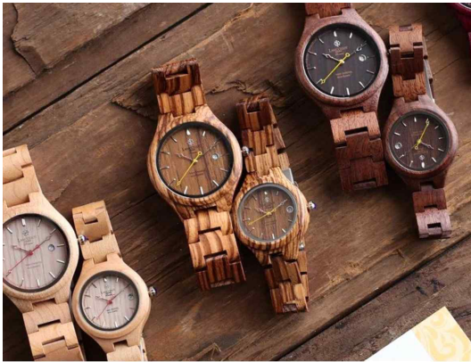
Fig. 4. Waste products in the form of jewelry (watches).