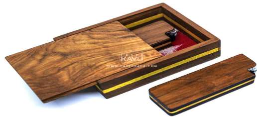
Fig. 1. Waste products in the form of souvenirs (match holders).

In addition to the limited supply of wood, social and