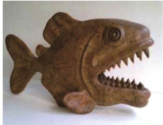
Fig. 5. Waste products are ornamental objects (e.g., fish). Adapted from Eskak (2016) with CC-BY.

In Jepara, some businesses focus only on producing furniture, rather than making other products as well. However, some businesses focus on souvenir production (Sofiana, 2011). The furniture production business has been in operation for a long time and is sustainable today. Wood and wood culture are viewed as material and cultural heritage, respectively (Han and Lee, 2021). Furthermore, furniture production activities continue so that space is available to develop new products. Some of these new products have been used to optimize wood