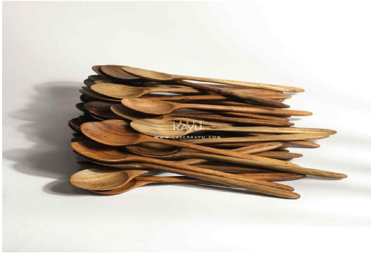
Fig. 3. Waste products in the form of functional objects (spoons). Adapted from permission of Laser Kayu (2023b).