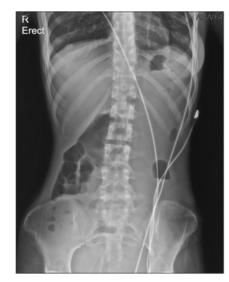
Fig. 3. The follow-up simple abdomen shows that severe gastric dilatation with pneumatosis improved.

Vomiting resolved immediately after the endoscopic removal of 1.6 L of stagnant gastric content. Intravenous proton pump inhibitors, piperacillin/tazobactam, metronidazole, and total parenteral nutrition were administered. Supportive care improved gastric pneumatosis within 5 days ( Fig. 3 ), and a soft diet was initiated after 11 days of nil per os (NPO) following an upper gastrointestinal series, which showed delayed contrast passage through the third portion of the duodenum. In addition to NPO, a somatostatin analog was administered to treat acute pancreatitis. Follow-up abdominal CT revealed a decrease in necrotic collection around the tail of the pancreas, and serum lipase and amylase levels improved within 10 days.