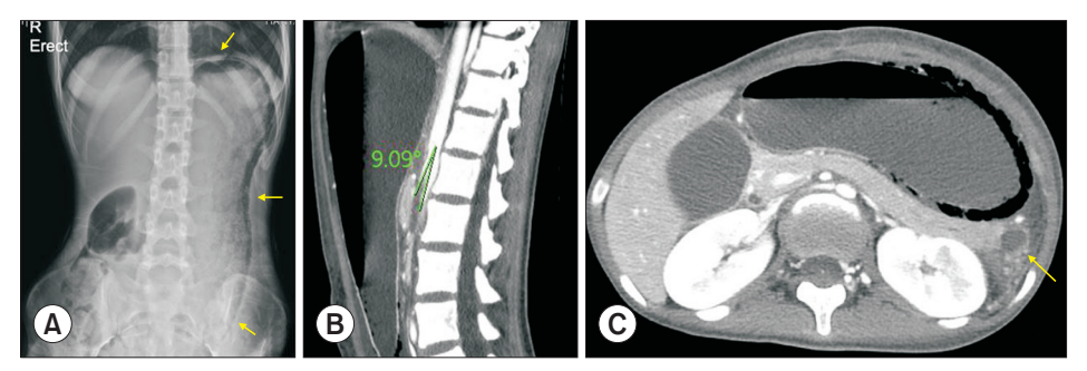
Fig. 1. The stomach and duodenum are markedly distended. Air in the stomach wall outlines (arrow) the fundus and the greater curvature (A). A significant narrowing of the aortomesenteric angle down to 9.09°, suggesting superior mesenteric artery syndrome (B). The abdominal axial scan shows massive distension of the stomach and the duodenum. Gastric intramural gas outlines almost the entire stomach wall. An acute necrotic collection around the tail of the pancreas (arrow) is also observed (C).

A nasogastric tube was immediately inserted to decompress the stomach. Thick, bloody bile-mixed food particles were drained from the stomach through a nasogastric tube. Gastrofibroscopy was performed for gastric decompression via the removal of a significant volume of gastric contents and to determine the bleeding point and mucosal lesions. Examination revealed multiple mucosal tears in the distal esophagus that developed after excessive vomiting due to SMA syndrome. Thick bile juice mixed with food and blood was observed in the stomach. Blood originated from esophageal tears and necrotic gastric mucosal lesions. As the stagnant intragastric material was removed, severe necrotic mucosal lesions and multiple bleeding ulcers with saccular cystic swelling were observed ( Fig. 2 ).