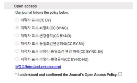
Figure 1: Open Access Policy

In particular, EAJBE strictly requires reviewers to meet the minimum criteria for the amount of review reports. In addition, the editorial committee secretes the author's personal information to the reviewer, checks in advance so that there is no relationship between the two parties based on academic background and career, and distributes the paper to the reviewer.