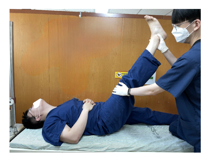
Figure 3. Sciatic nerve NM

NM was performed based on the level of the nerves at which the symptoms appeared. The treatment proceeded until the location where the symptoms recurred. It was eased a few degrees at the point of symptom recurrence, and was performed with continuous mild oscillations. The slider technique was performed by repeating cervical extension to flexion during the intervention with longitudinal