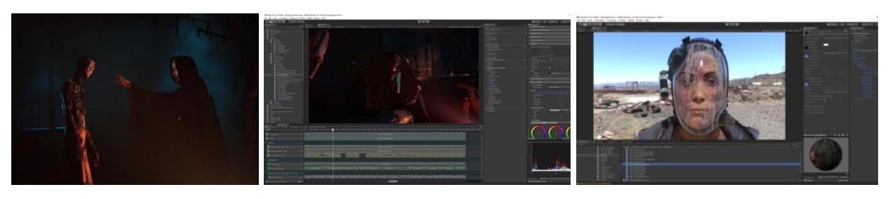
Figure 3 - The short film Adam and some production images [17]