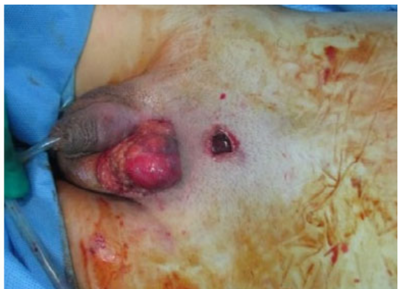
Fig. 1. Pictures of initial portable X-ray and wound showed the anterior posterior compression type III open pelvic bone fracture.