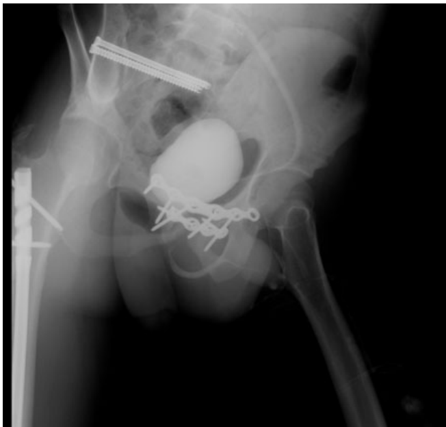
Fig. 3. After 3 months of suprapubic cystostomy alone, the patient showed complete healing of posterior urethral disruption. There was no evidence of urinary leakage or urethral stricture.

plain of any signs of urinary leakage or urethral stricture. In addition, he reported no erectile dysfunction or urinary incontinence.