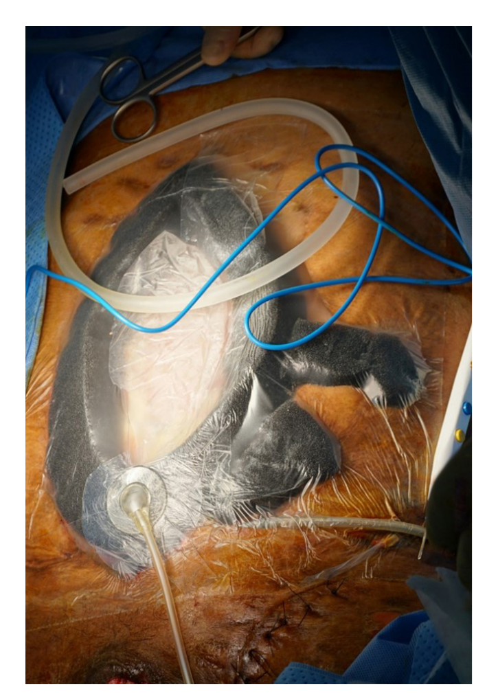
Fig. 3. Negative pressure wound therapy.

management of patients with OA requires three fundamental steps: (1) hemodynamic resuscitation, (2) source control of abdominal infection, and (3) delayed abdominal closure [3]. Thus, a severe abdominal infection may extend the period of the second step, resulting in delayed abdominal closure. In this case, abdominal contamination had seriously progressed due to multiple necrosis of the small and large intestines and the occurrence of an EAF following rectal and colon damage.