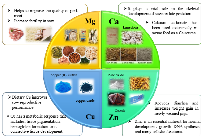
Fig. 1. Health benefits and beneficial application of micro and macro-minerals in non-ruminant.