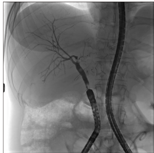
Fig. 2. Endoscopic retrograde cholangiography in a liver transplant recipient with biliary-enteric anastomosis.

Biliary stricture are the most common adverse outcomes of LT. They are associated with allograft rejection, allograft failure, infections, readmission to the hospital, and death [15]. These strictures vary in severity, etiology, and location [16]. The clinical impact of post-transplant biliary strictures can