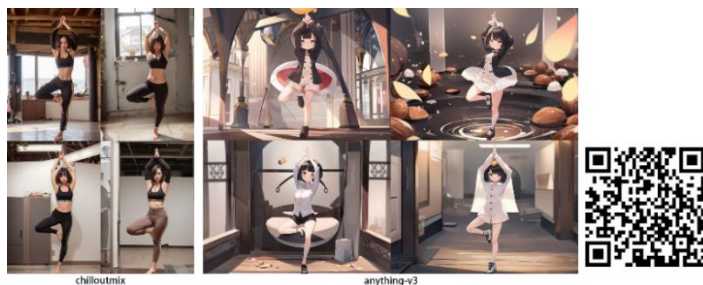
Figure 8. The Posture Output in Stable Diffusion

On the other hand, in Stable Diffusion, using its ControlNet open pose and Tagger image to text functionalities, we can obtain the results shown in Figure 8.