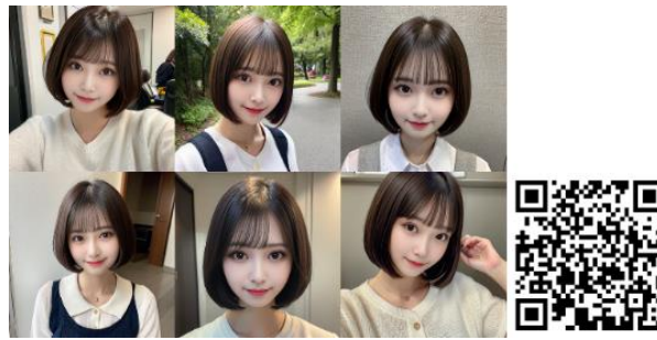
Figure 3. Stable Diffusion Model Chilloutmix Add Lora

When no specific age description is given for a girl, except in the case of 2D animation style, Midjourney's "a cute girl" tends to portray a child-like appearance, while Stable Diffusion leans towards a teenage representation. Overall, both software can achieve good results in visual depiction, each with its own advantages. Midjourney requires only prompt words and is more straightforward to obtain excellent results. On the other hand, Stable Diffusion offers greater flexibility with a wide range of models, plugins, and a greater number of adjustable parameters. There are slight differences in the artistic styles within the same genre between the two software applications.