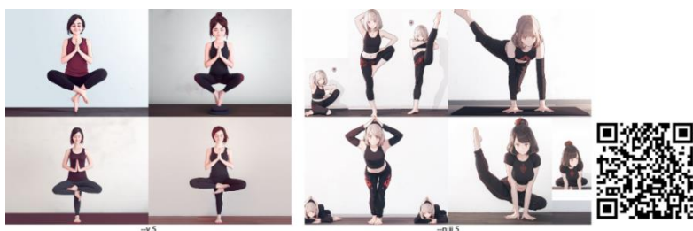
Figure 7. The Posture Output in Midjourney

“ Prompt: https://s.mj.run/gfYxAZNgiv4 , a cute girl, almond-shaped eyes, bob cut, button nose, oval face, doing her yoga, in the style of light maroon and dark black, precisionist lines, asymmetrical balance, smile core, Samikshavad, full body, clean-lined --ar 4:3 ”