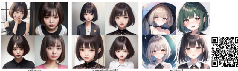
Figure 5. Stable Diffusion Expression

When it comes to depicting a crying expression, both Midjourney and Stable Diffusion faced significant challenges. Midjourney's V4 model can draw a crying expression, but the color of tears is consistently incorrect. The V5 model portrays a more accurate "sad" expression. Similarly, Stable Diffusion's realistic style characters encountered similar issues in depicting crying expressions. The expressions lacked sufficient sadness and either did not depict tears or inaccurately rendered them. Surprisingly, both software applications