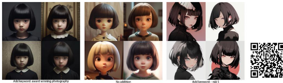
Figure 1. Midjourney Facial Features

“ Prompt: a cute girl, almond-shaped eyes, bob cut, button nose, oval face ”