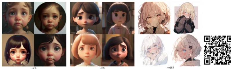
Figure 4. Midjourney Expression

“ Prompt: a cute girl, almond-shaped eyes, bob cut, button nose, oval face, crying ”