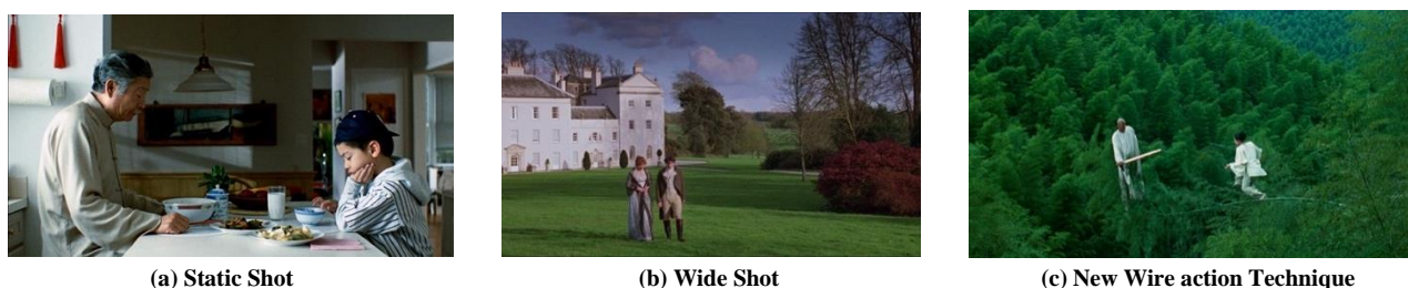
Figure 1. Changes in Cinematography Techniques

reinterpreting the wire action technique. In the past, the limitations of screen composition were significant because actors performed in a weightless state during wire action scenes. Therefore, the predominant method was to use close-ups of the upper body to minimize the illusion [9]. However, director Ang Lee introduced creative ways to overcome these limitations. As shown in Figure 1(c), He developed a special camera frame that moved with the actors, allowing aerial combat scenes to be filmed. As a result, long-distance scenes of the bamboo forest battle could be beautifully depicted with a composition similar to Eastern paintings. With this example, director Ang Lee is actively responding to the development of film technology and exploring new possibilities in film production. The bamboo forest battle scene in "Crouching Tiger, Hidden Dragon" can be regarded as a work in which his creativity and technical ingenuity are combined, and it has opened up new horizons for wire action technique.