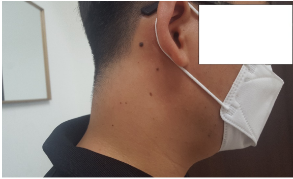
Fig. 1. The picture above is a picture of a mass in the neck when the patient first came to the outpatient clinic.