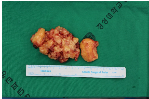
Fig. 4. This is a photograph of a specimen obtained through surgical removal.

A part of the mass was removed first and sent for a frozen biopsy, which confirmed that it was benign lipoma. The mass was then held with forceps or allis tissue forceps, split into pieces, and removed. Loose tissues around the tumor were easily separated from the surrounding tissues when