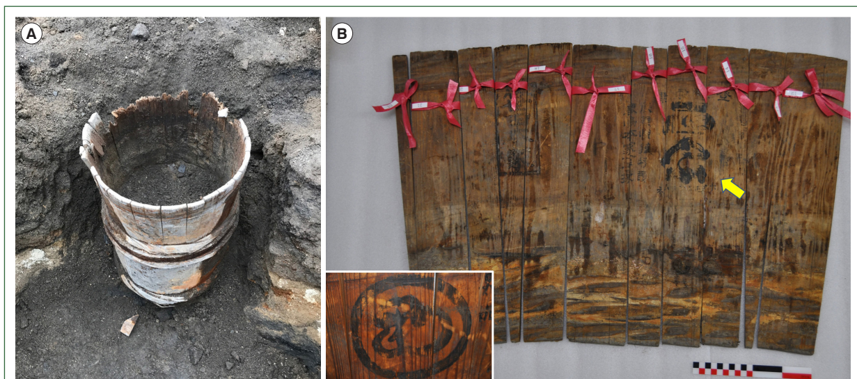
Fig. 1. A wooden structure found at the Building No. 7 ruins. (A) The toilet-like structure was made by stacking 2 wooden barrels. (B) Date estimation of the barrels. Note the marking of an early 20th-century Japanese liquor (yellow arrow) and the trademark of a Japanese vinegar company (inset of B).

Among the 7 sample layers, we found ancient parasite eggs of Trichuris trichiura , Ascaris