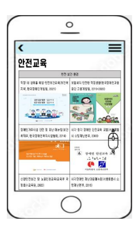
Figure 3: Safety and Health Education Contents

The safety and health education contents of the app to be designed in this study were composed of two categories. First, safety and health education materials related to the disabled, who are vulnerable to disasters, were collected and provided in the form of a table with pictures so that they could be visually confirmed. The design of the application is shown in <Figure 3>.