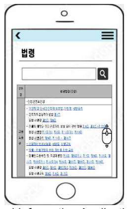
Figure 2: Legal Information Application Design

It is designed so that when you click on the provision of law information category, you can check major ministries, major laws and relevant provisions at a glance. Domestic central government agencies were organized around the Ministry of Employment and Labor, the Ministry of Health and Welfare, and the Ministry of Public Administration and Security, which are highly related to workplaces for the disabled. The law information link model is shown in <Figure 2>.