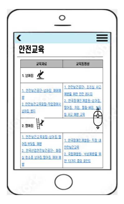
Figure 4: Example of Safety and Health Education Content Video Model

Links to relevant educational materials were selected and loaded with emphasis on materials suitable for the eye level of workers with disabilities, such as safety training videos customized for disabled people by the Korea Institute for Persons with Disabilities and the Ministry of Public Administration and Security. The design of the application is shown in <Figure 4>.