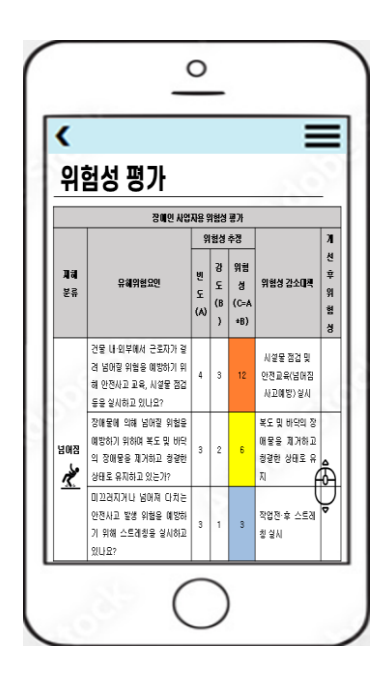
Figure 6: Risk Assessment Application Design