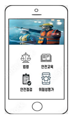
Figure 1: Application Configuration