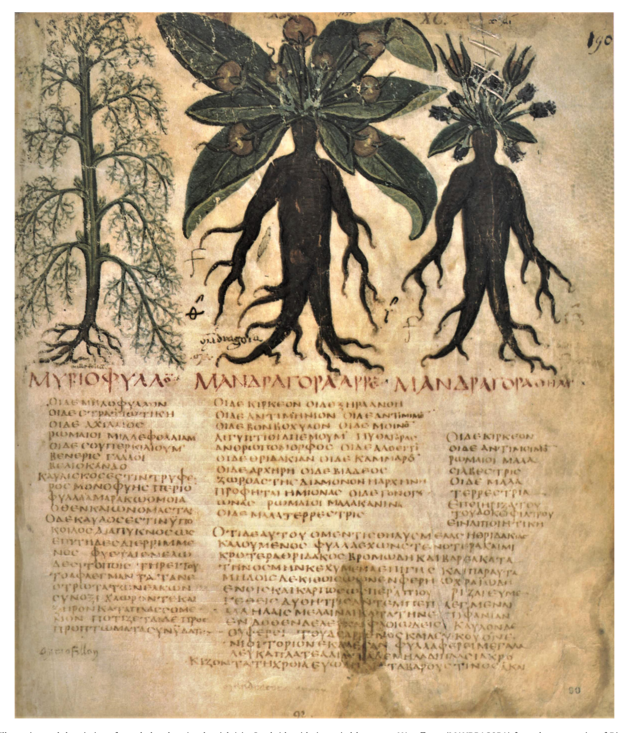
Fig. 2. Illustration and description of mandrake plant (to the right) in Greek (the title in capital letters MANΔPAΓOPA (MANDRAGORA) from the manuscript of Dioskouridis Pedanios Περί ΰλης ἰατρικής (De Materia Medica, Folio 90, Dioskouridis di Napoli, National Library, Cod. Gr.1, Naples).

was free and there were doctors from all walks of life. Anyone who wanted to study pharmacy (Kai-jo-p'outi) had to attend the small school (elementary education, learning to read and write) and the large school (Ta-hio), where science was taught. Then they learned prescription from the book "Yo-sing-fou", and pharmacology from the "Pen-tsao" [46,54].