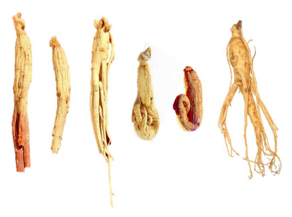
Fig. 1. The various forms and color of the genus Panax according to the preparation and species (such as red or white).