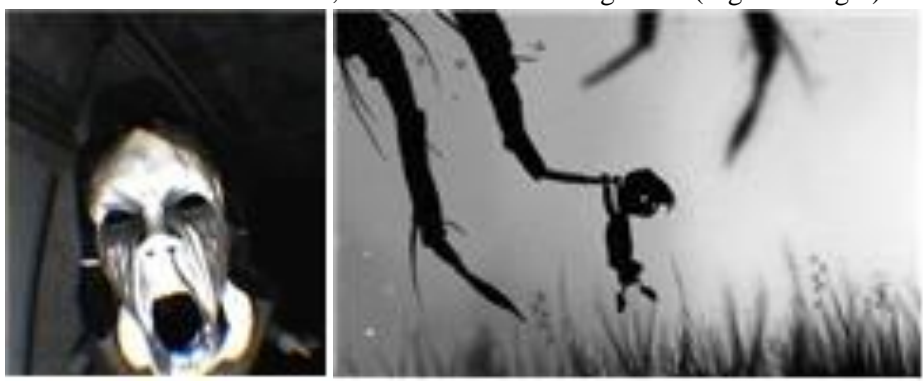
Figure 3. VR horror game 'Affeected'(left) and Side-scrolling horror Game 'Limbo'(right)

safe state, so they can manipulate the character and make various attempts. Even for horror games, the negative impact on players is relatively small. In addition, since the game perspective of the side-scrolling—game is a fixed perspective of the side view, the player will play the game with a mentality of watching tragedy, even if the character suffers a very cruel encounter, the player will not immersively feel the suffering and be overly frightened. At this time, the player's feeling is similar to watching a tragic horror drama in the audience. Although the content of the drama is horrific, the audience is not frightened (Figure 3. right).