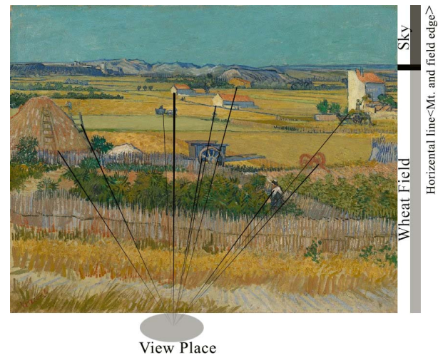
Fig. 4. Harvest at La Crau, with Montmajour in the Background, Vincent van Gogh (June, 1888) 12)