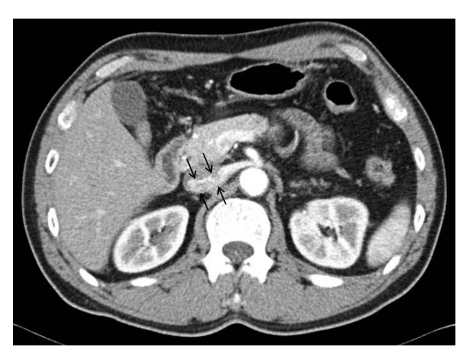
Fig. 2. Normal left renal vein preferential flow pattern. Normal preferential flow of contrast medium is observed along the posterior dependent margin of the left renal vein and inferior vena cava (arrows).

who were unaware of the clinical information to determine whether the findings suggesting NCS are present or not on the CT images. When the two interpreters disagreed, they arrived at a consensus through discussion.