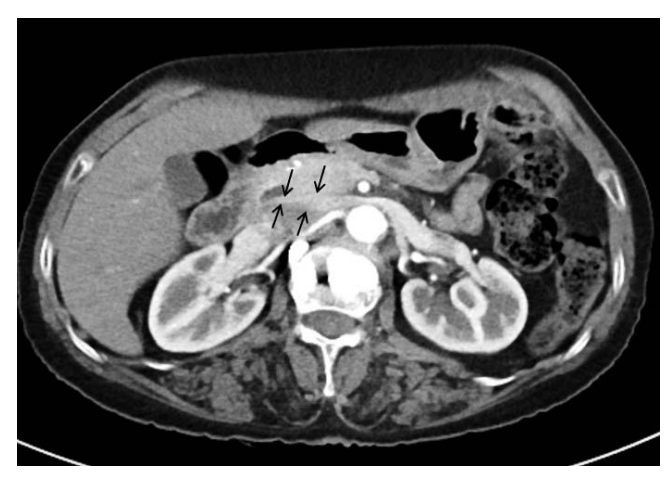
Fig. 4. Nutcracker syndrome. Contrast-enhanced CT image of a 66-year-old female in the early arterial phase. Preferential flow of contrast medium is observed along the anterior non-dependent margin of the left renal vein and inferior vena cava due to high flow velocity, suggestive of nutcracker syndrome (arrows).